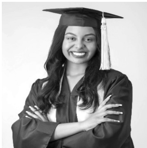
REDD GRADUATES FROM RJR